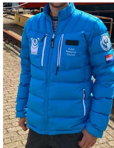
The inner jacket (puff)

This reflects the population of polar researchers in the Netherlands (although the current PhD cohort is close to 50-50!). Also, females often fit the straighter male model, vice versa is rare.