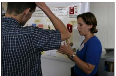
IMPRESSIONS OF THE POSTER SESSION