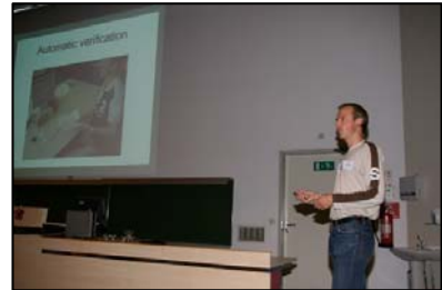
THREE PARALLEL WORKSHOPS