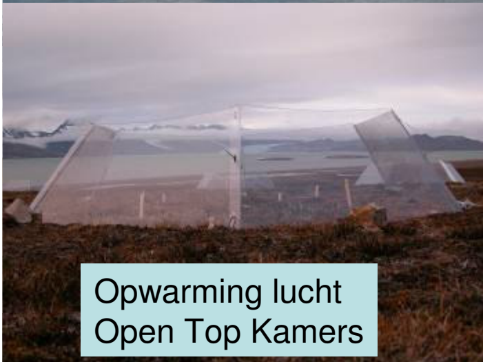
Opwarming lucht Open Top Kamers

NL IPY project 851.40.051 Tarantellaproject